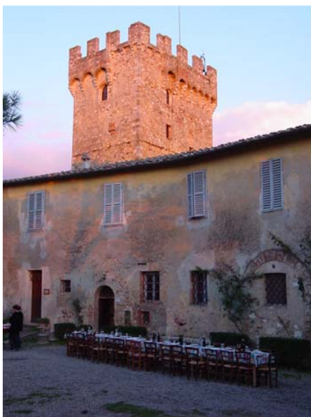
The Castle Tower hit by the setting sun and tables set up for pizza night below.

The Fall Session devoted a lot of their time to making Spannocchia a better place to live and work. All interns chose to participate in after-hours discussions about the importance of Spannocchia in their lives, and how best to describe the Internship Pro-