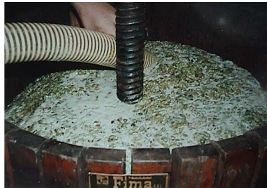
White grapes going through the press.